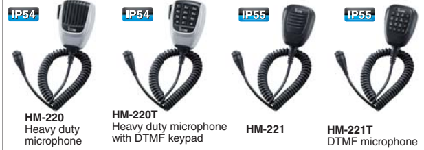
HM-220 Heavy duty microphone