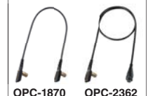
OPC-1870 Handheld to handheld cable