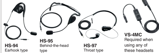
HS-94 Hook type