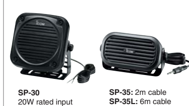
SP-30 20W rated input