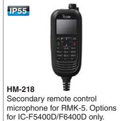
HM-218 Secondary remote control microphone for RMK-5. Options for IC-F5400D/F6400D only.