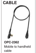
OPC-2362 Mobile to handheld cable