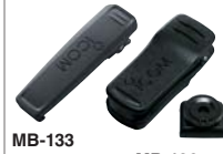
MB-133 Alligator type