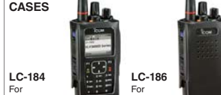
LC-184 For IC-F3400D/DS, F4400D/DS